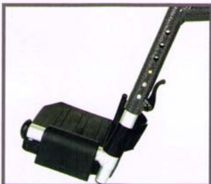
Quick-Adjust Footrests Adjust height without tools using spring-loaded detent buttons. Heel loops adjust with Velcro ® .