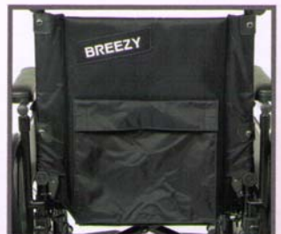
Height-Adjustable Back with Pocket Store personal items/documents in pocket with closing flap. Adjust height easily without tools.