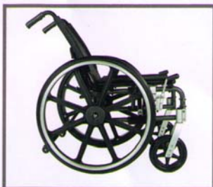
Angle-Adjustable Back Back adjusts from 6° anterior to 24° posterior in 6° increments for better positioning. Height adjusts to 17", 18" or 19".