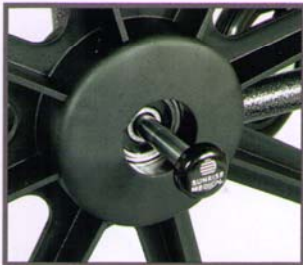
Quick-Release Wheels Make loading in/out of vehicles easy.