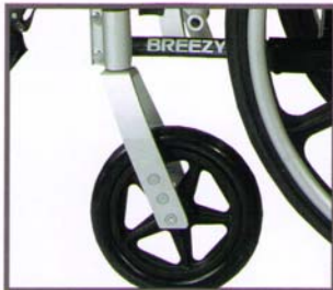
Angle-Adjustable Front Casters Accommodate angled seating surfaces without moving the caster housings out of square.