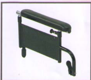
Height-Adjustable Arms 4" vertical adjustment allows for use of cushions.