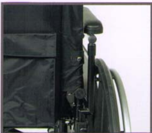
Wraparound Armrest Provides a narrower overall chair width.